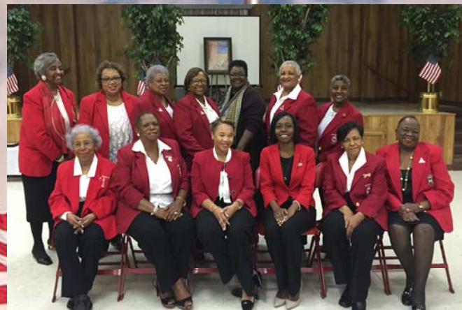
A Delta Dears and Political Awareness Collaboration